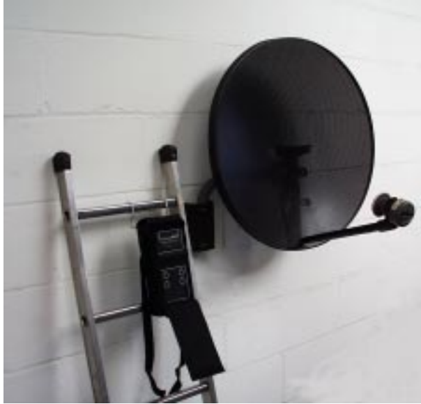
Type:- Digi~Sat 2001